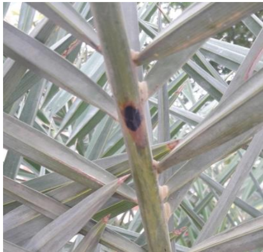
Figure 4. The presence of a large black bug.