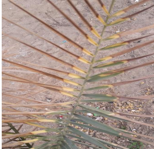
Figure 2. Yellowing of leaves at the site of infection.