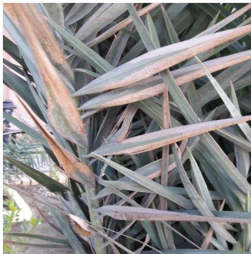
Figure 3. Yellowing begins at the top of the leaf, the site of infection.