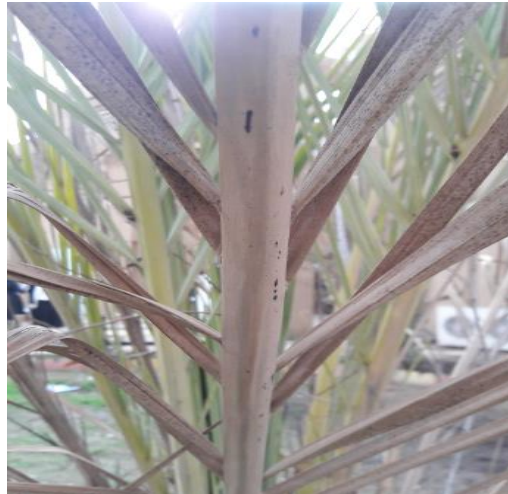
Figure 5. There are black spots on the leaves, circular or elongated.