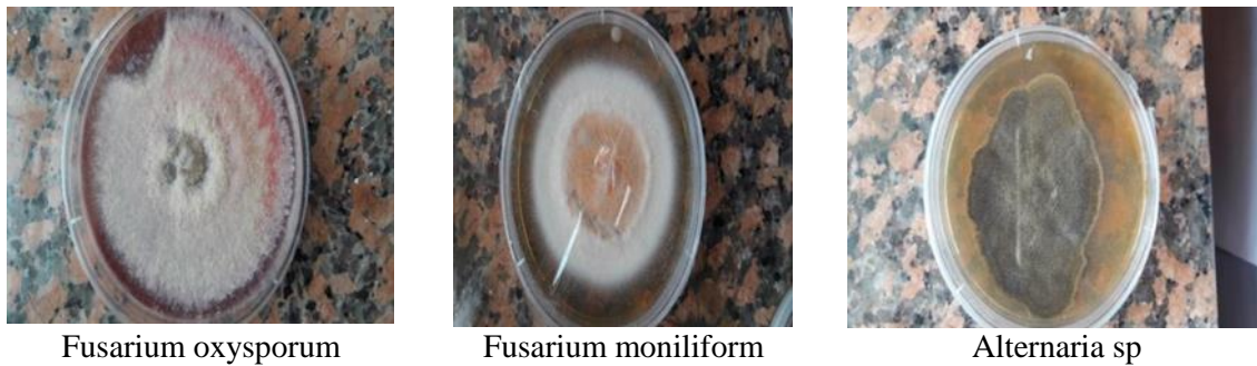
Figure 1. Fungi isolated from palm trees.

according to what was mentioned above. Then the purified fungi were identified based on the fungal hyphae and the colors and shapes of the conidia and their carriers according to the available taxonomic keys (Watanabe, 2002).